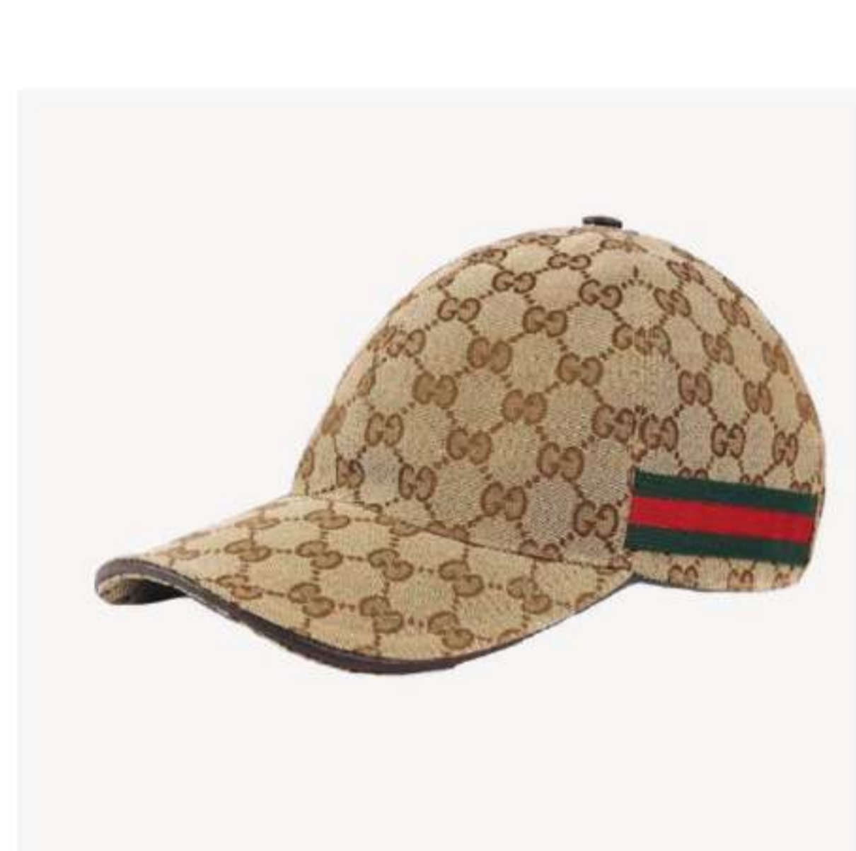
Pet Gucci € 290,00