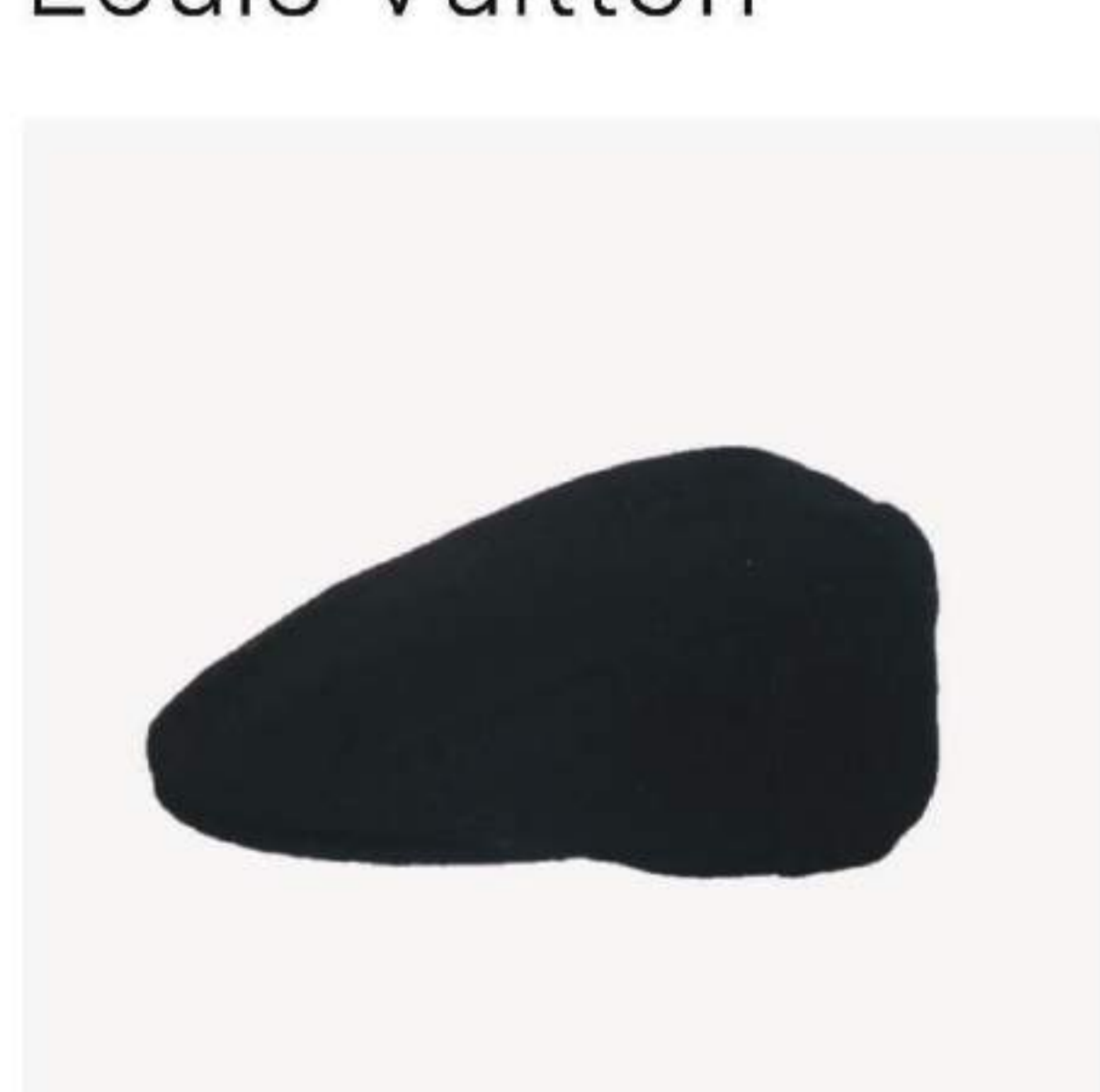
Pet Rodolfo € 60,00