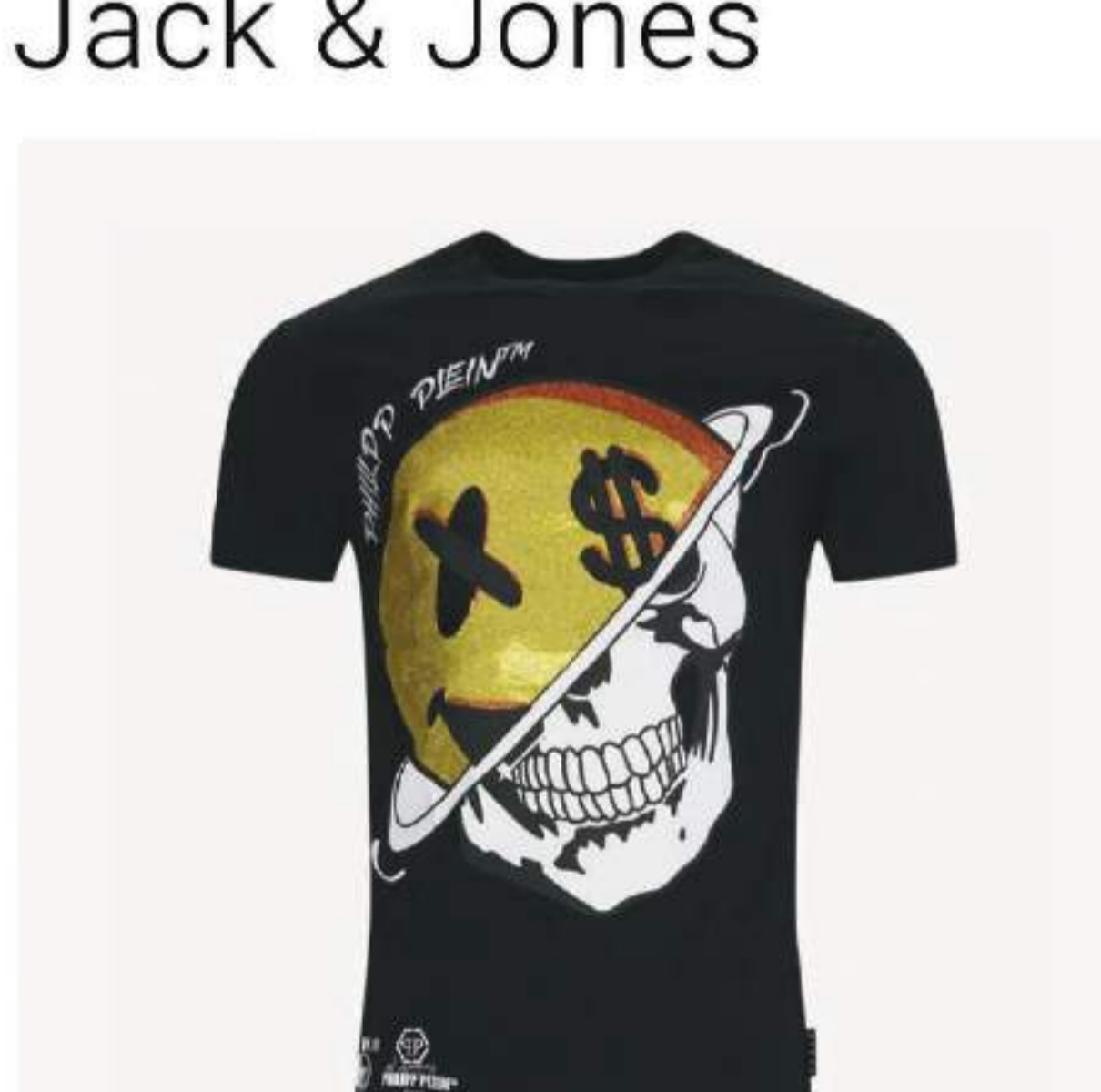
Shirt Philipp Plein € 180,00