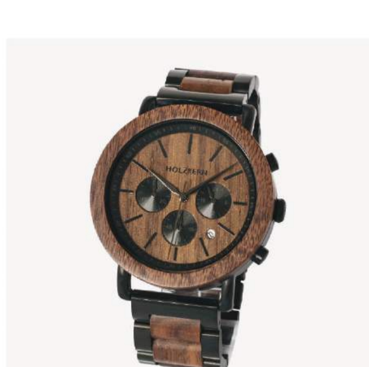
Horloge Holzkern € 350,00