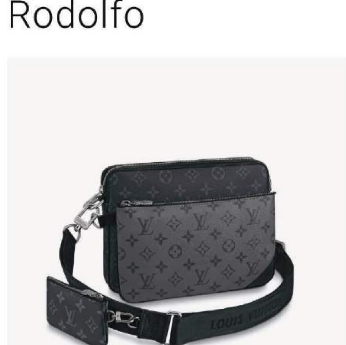
Tas Louis Vuitton € 890,00