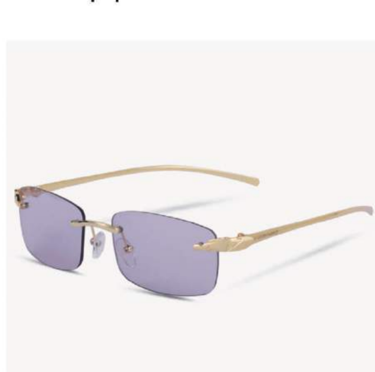
Bril Cartier € 450,00