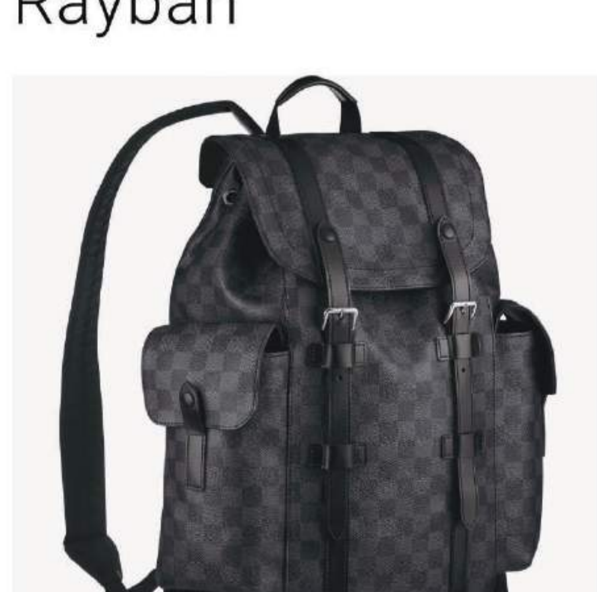
Tas Louis Vuitton € 1600,00