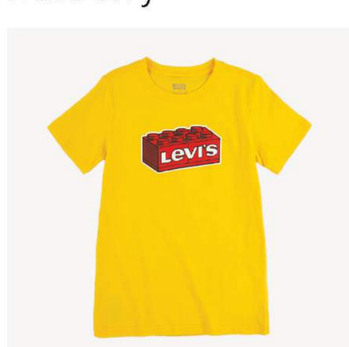
Shirt Levi's € 30,00