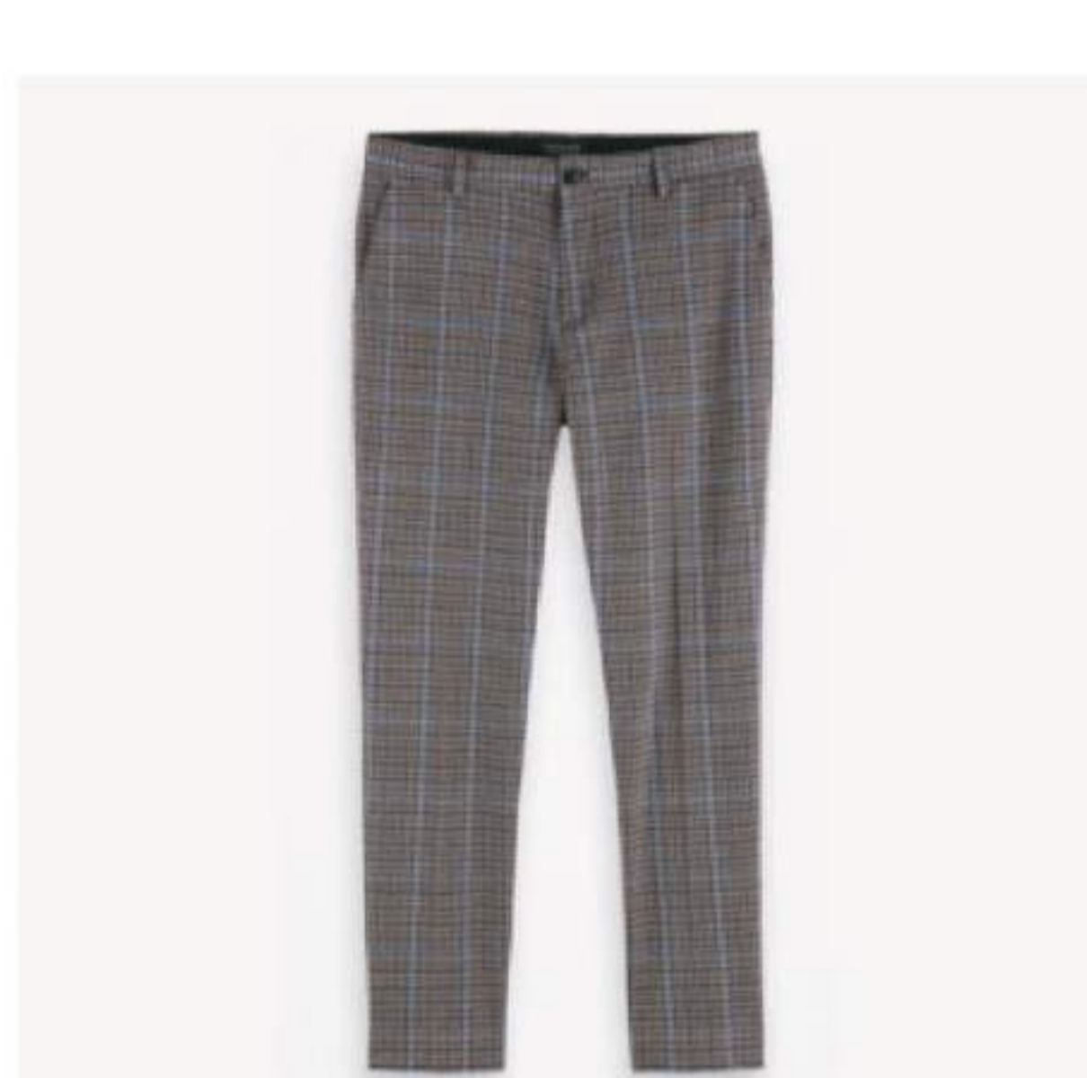
Broek Jack & Jones € 70,00