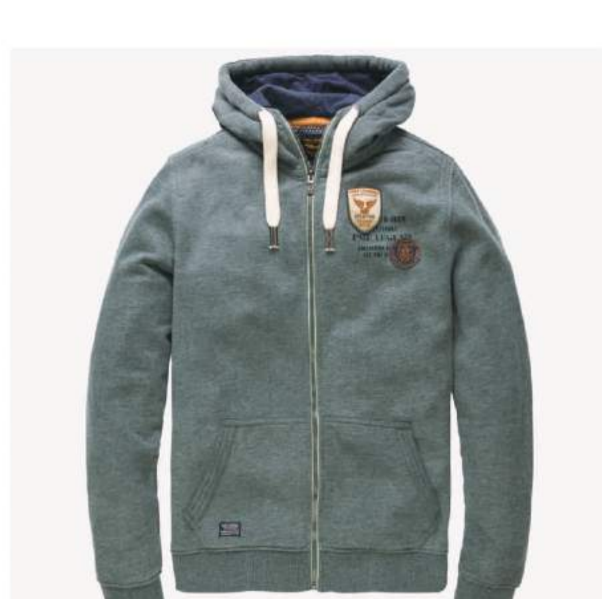
Vest Patrol € 40,00