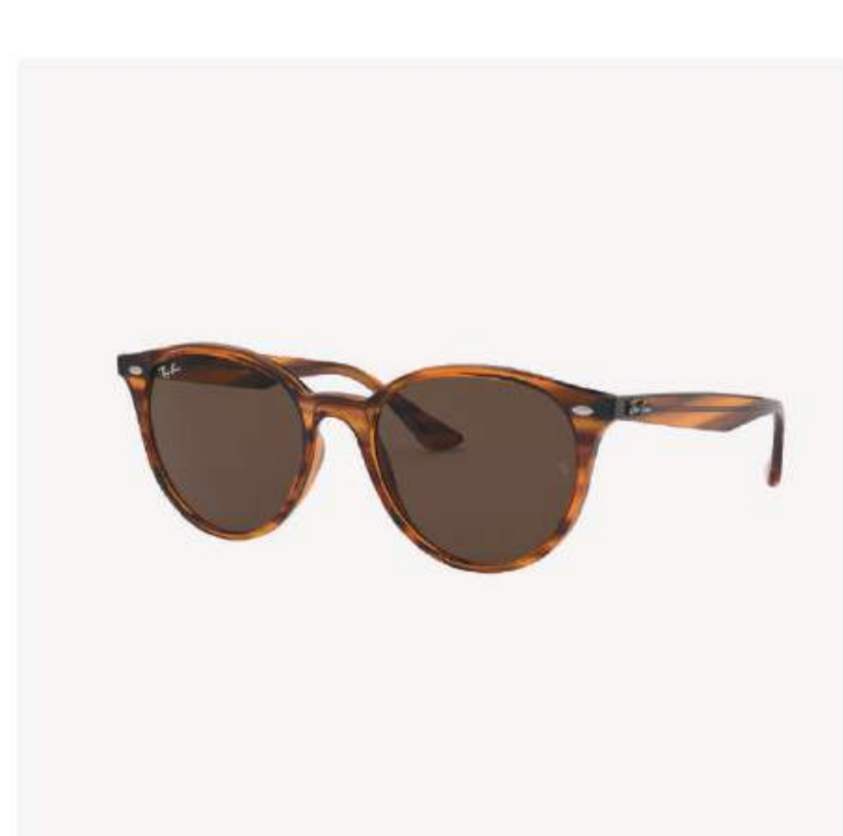
Bril Rayban € 150,00