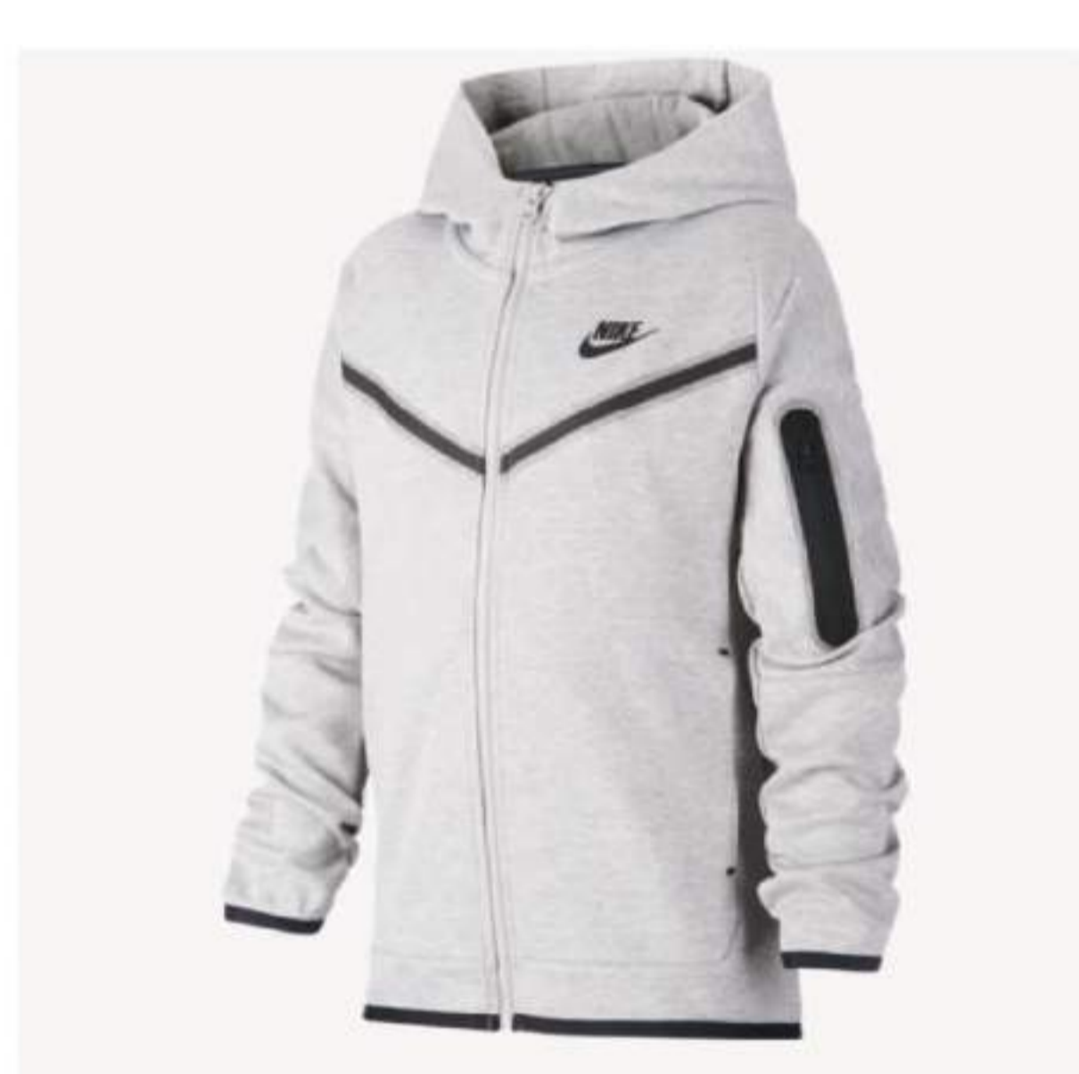
Vest Nike € 70,00