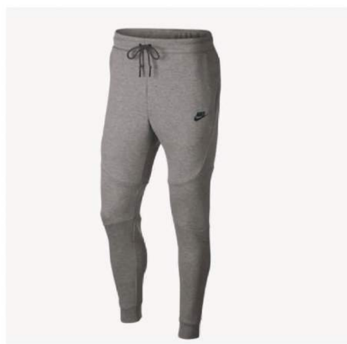
Broek Nike € 80,00