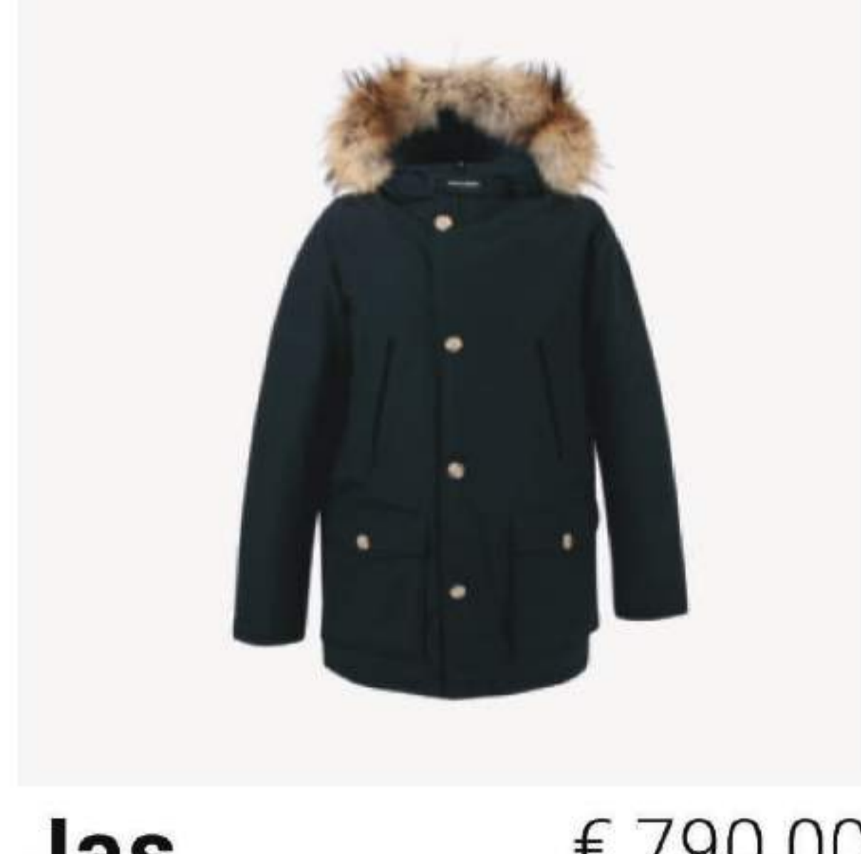
Jas Woolrich € 790,00