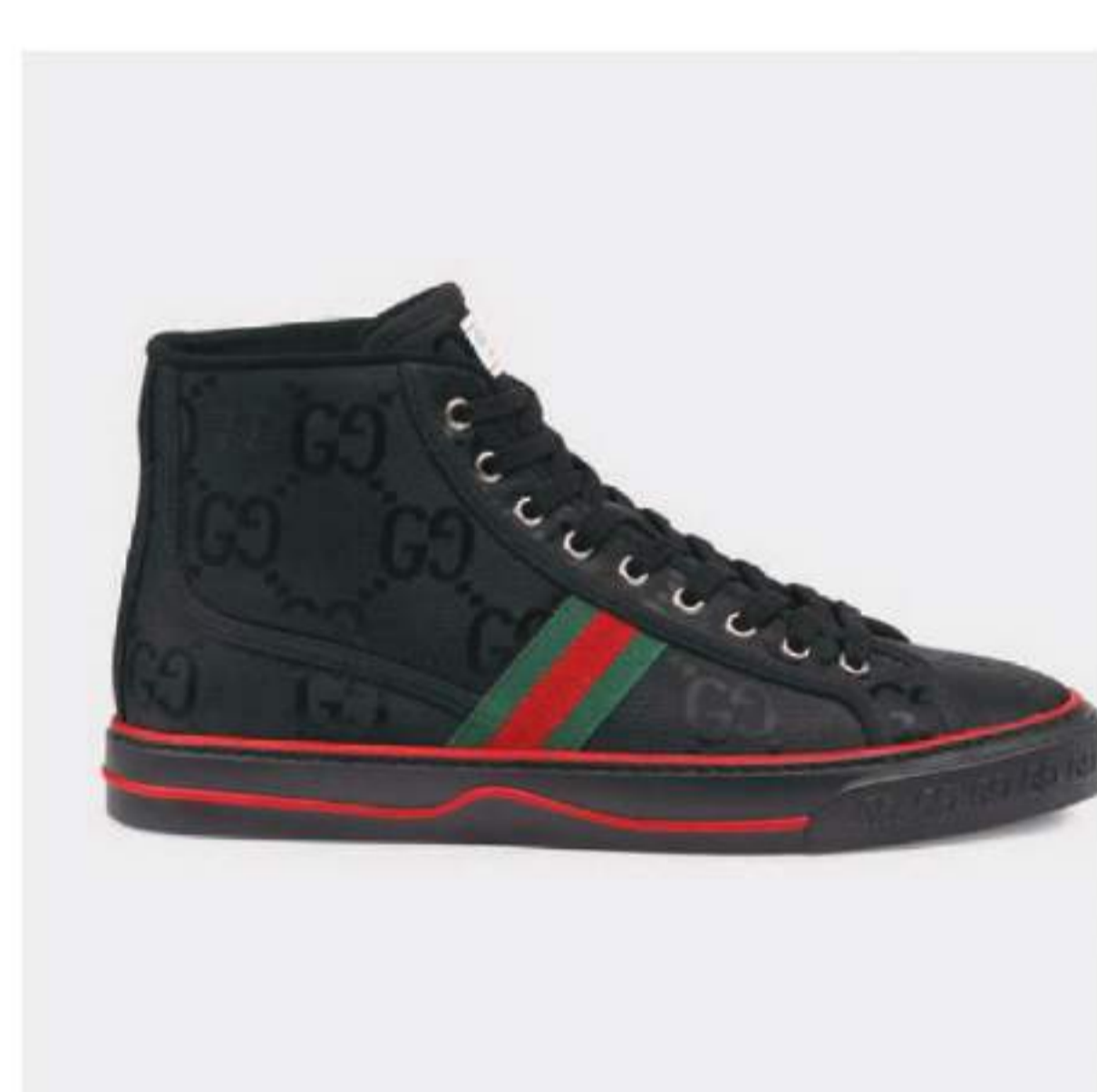
Sneaker Gucci € 590,00