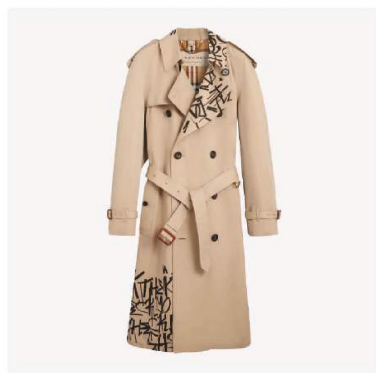
Jas Burberry € 810,00